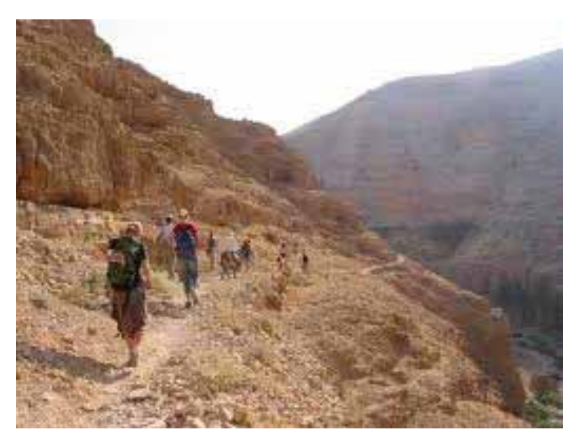
Road from Jericho to Jerusalem. This old road is still a dangerous one.